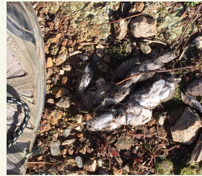
Coyote Scat on Logging Road, near Blue Mountain, Cassie Kent

In this news feature from Global News , you can learn more about the impact of what we leave behind as evidenced by this coyote scat containing plastic pieces, found near Blue Mountain. This again serves to remind of the importance of looking after our natural places, especially where plastics are known to have such a long-lasting impact on our environment. If you'd like to learn more about Leave No Trace in Canada, see here .