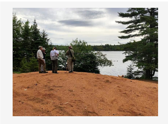
Sawdust at Maple Lake