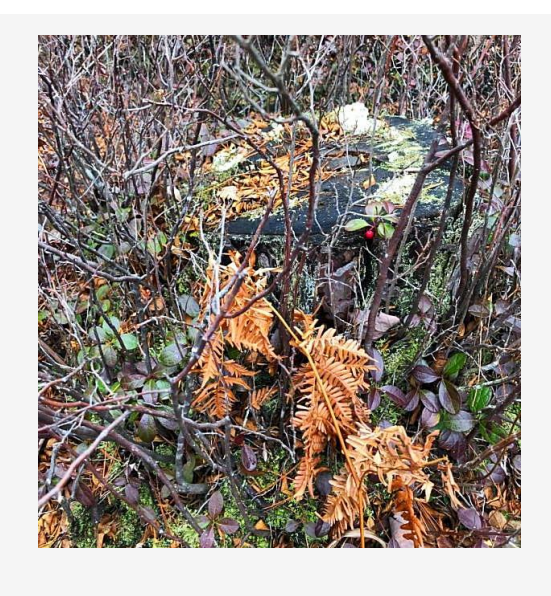
Stump near Charlies Lake

Many of you will know that most areas of Nova Scotia have, at some time, been harvested for timber. The BMBCL is no exception and if you have a sharp eye on your walks, you'll see the evidence in a lot of places. We know that there were at least two active sawmills on the edge of the BMBCL: one at Maple Lake near Timberlea and another in what is now Kingswood subdivison, at McQuade Lake. In fact, as recently as 1959, there were 53 sawmills listed as active in Halifax County - five of which were in Hammonds Plains and one in Timberlea. Products from those mills included lumber, shingles, ties, box shooks and lathes. We would need to do some more research to get the backgrounds on the Maple & McQuade Lakes mills - any historians out there?