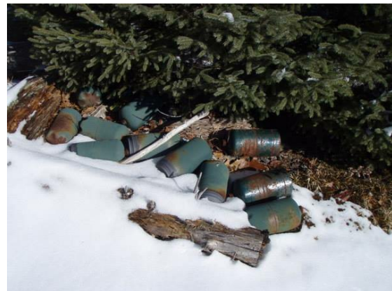
Crane Lake campsite this winter

In our travelings, we continue to find evidence of past visitors to the BMBCL. To all of you that make the effort to carry out your own and other's waste - well done! As more and more visitors discover the BMBCL, waste left behind will likely continue to be an issue. Let's all keep working to leave our favorite places in a natural state - the way we like to find it on our next 'arrival'.