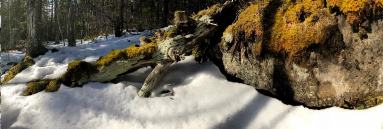
Late Winter Sun...on the trail to Charlies Lake