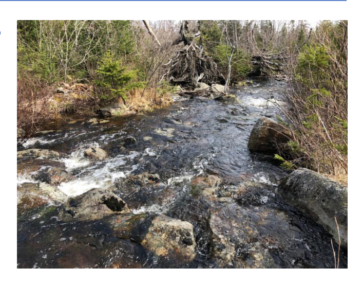
Barrett Lands stream - muskrat observed here. Ed.

Friends was an active participant in this announcement on April 24 where MP Darren Fisher provided details of the federal contribution ($860,000) c/o the Canada Nature Fund towards two more properties for the HRM regional park. Mayor Savage further described the purchases as the Armco (135 acres) & Barrett lands (200 acres).