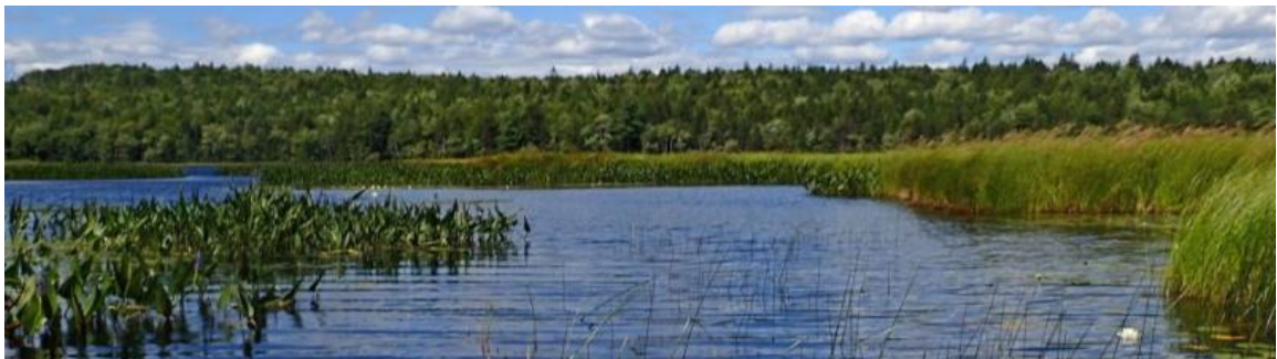
Sandy Lake, Bedford

The Coalition's objective is to secure an additional 1,000 acres to be added to the existing Sandy Lake/Jacks Lake Regional Park in an effort to maintain the water quality of Bedford's Sandy Lake and the Sackville River. This acreage contains much of the ground water feeding into Sandy Lake and is favoured with some amazing old growth forest. This is all of part of the Sackville River watershed and thus is extremely important ecologically in the future health of the river. Friends recognizes the importance of the retention of this acreage as an important resource and wildlife corridor - now at risk from rapid urbanization.