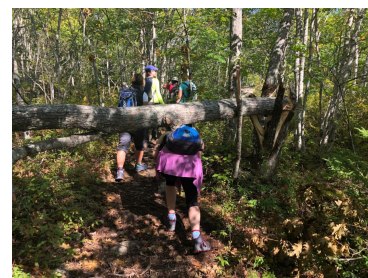
Near Fox Lake