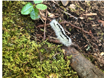
Hickory Tussock Moth Caterpillar