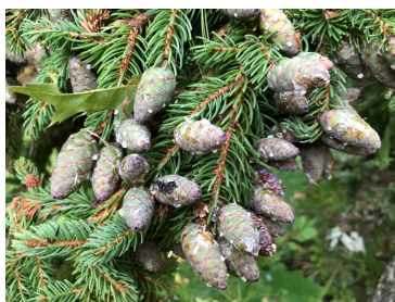
Red spruce down... view at the top!