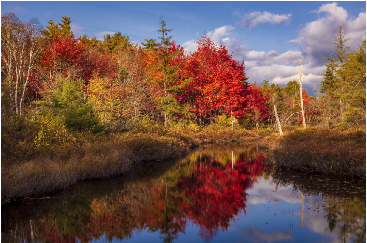
Irwin Barrett, Black Duck Brook

NEWS Background: Red Pine, Charlies Lake