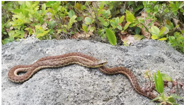
Eastern Garter Snake