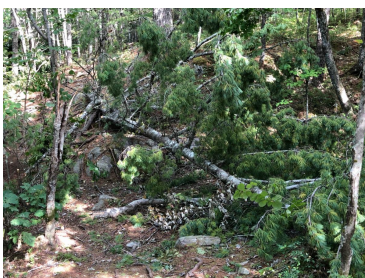
Hobson Lake Trail

Other than a few trees down, from all reports the September 7th impact from Dorian was minimal in the BMBCL. Thanks to those who took the time to clean up some of the trails.